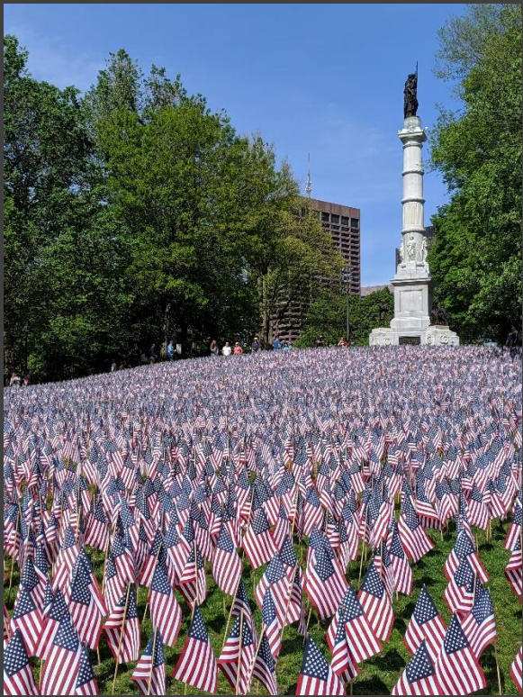
Top: Boston Common Flag Garden (Memorial Day 2019) Bottom: A significantly less grand, more local display (Memorial Day 2020).