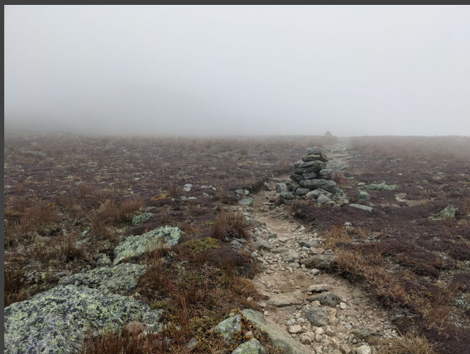
Crawford Path trail along the Presidential Traverse.