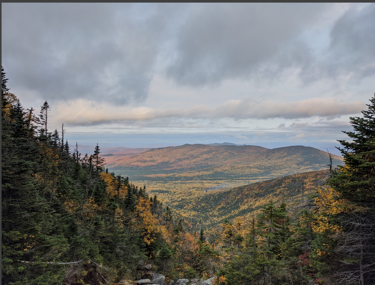
View going up the Ammonoosuc Ravine Trail.