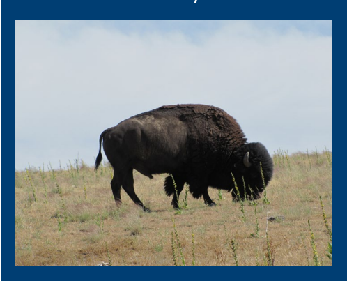
Oh give me a home...