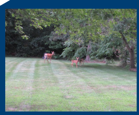
Remember the good 'ol days when we worried about Lyme disease?