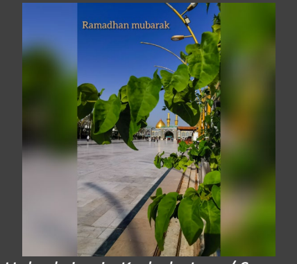
Holy shrine in Kerbala-Iraq

This year the Month of Ramadhan is different! Usually we attend community gatherings before sunset so we can break fasting together as a community. This year, we sat quietly! No rush and not me driving to get home from work so I can get some rest then share the table with everyone! This year our month of Ramadhan is unique in a bizarre way! A reflection of self-assessment and a stop to your routine and understand Ramadhan. It is an opportunity for those of us who have families overseas and couldn't make it before the month of Ramadhan to be with us to appreciate the presence of each one of someone's family around the same table in this month. And to remember, that fasting while family is away is just another lesson in patience and tolerance.